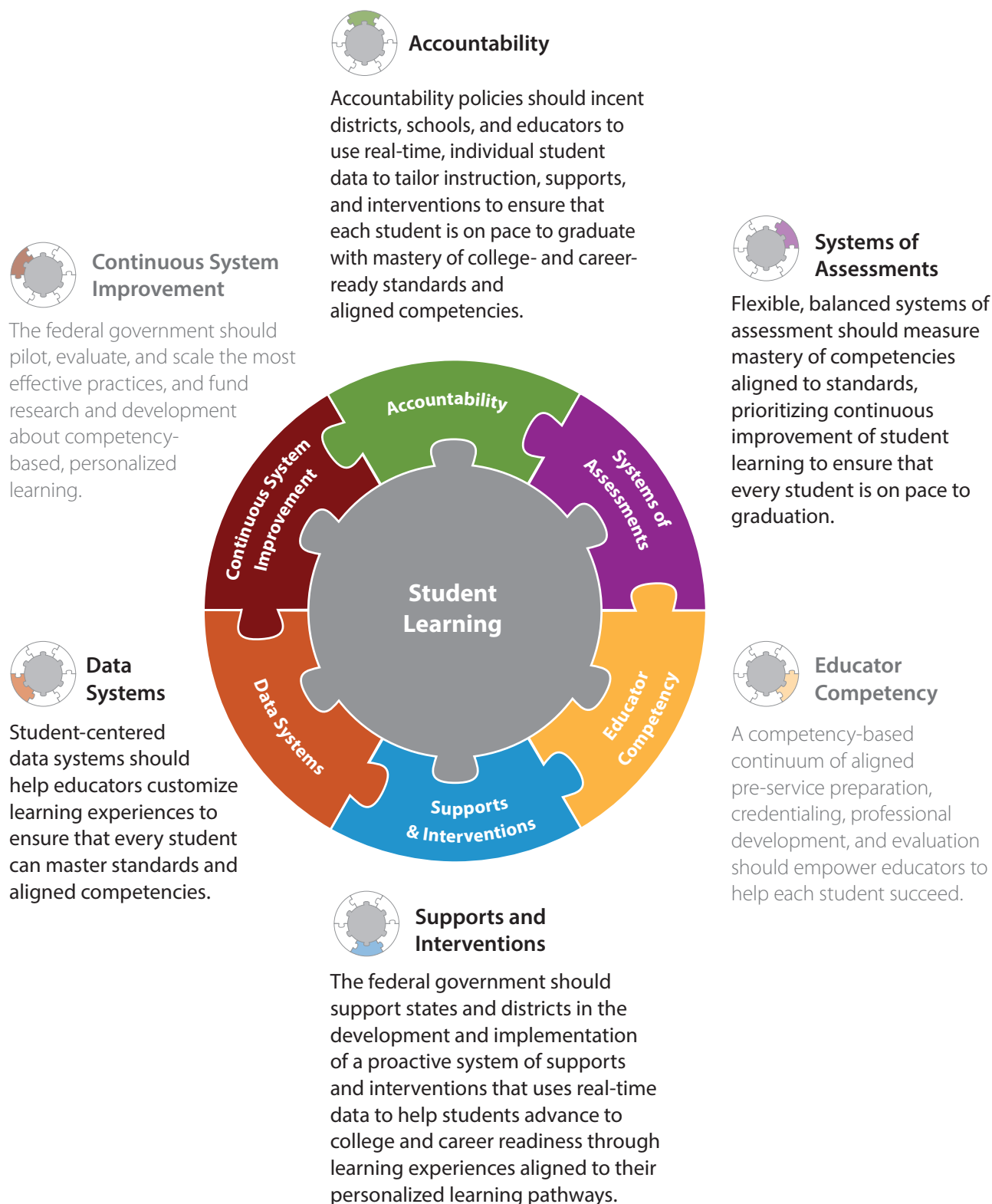
FIGURE 2: Enabling Policy Framework for Competency Education